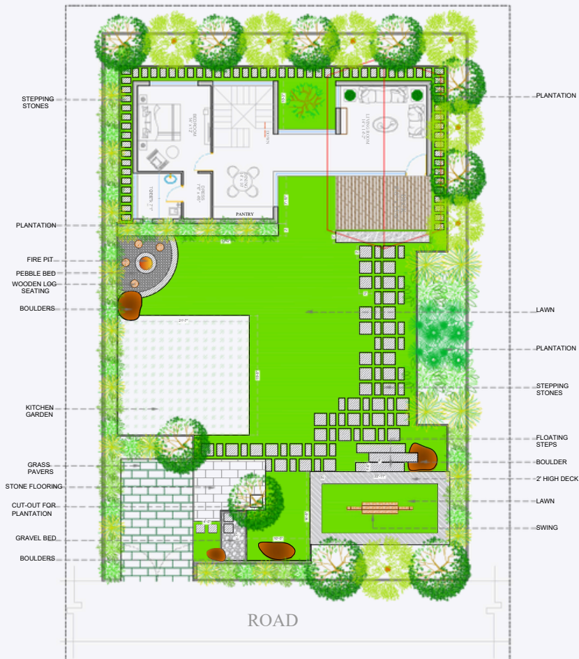
EAST FACING DUPLEX VILLA